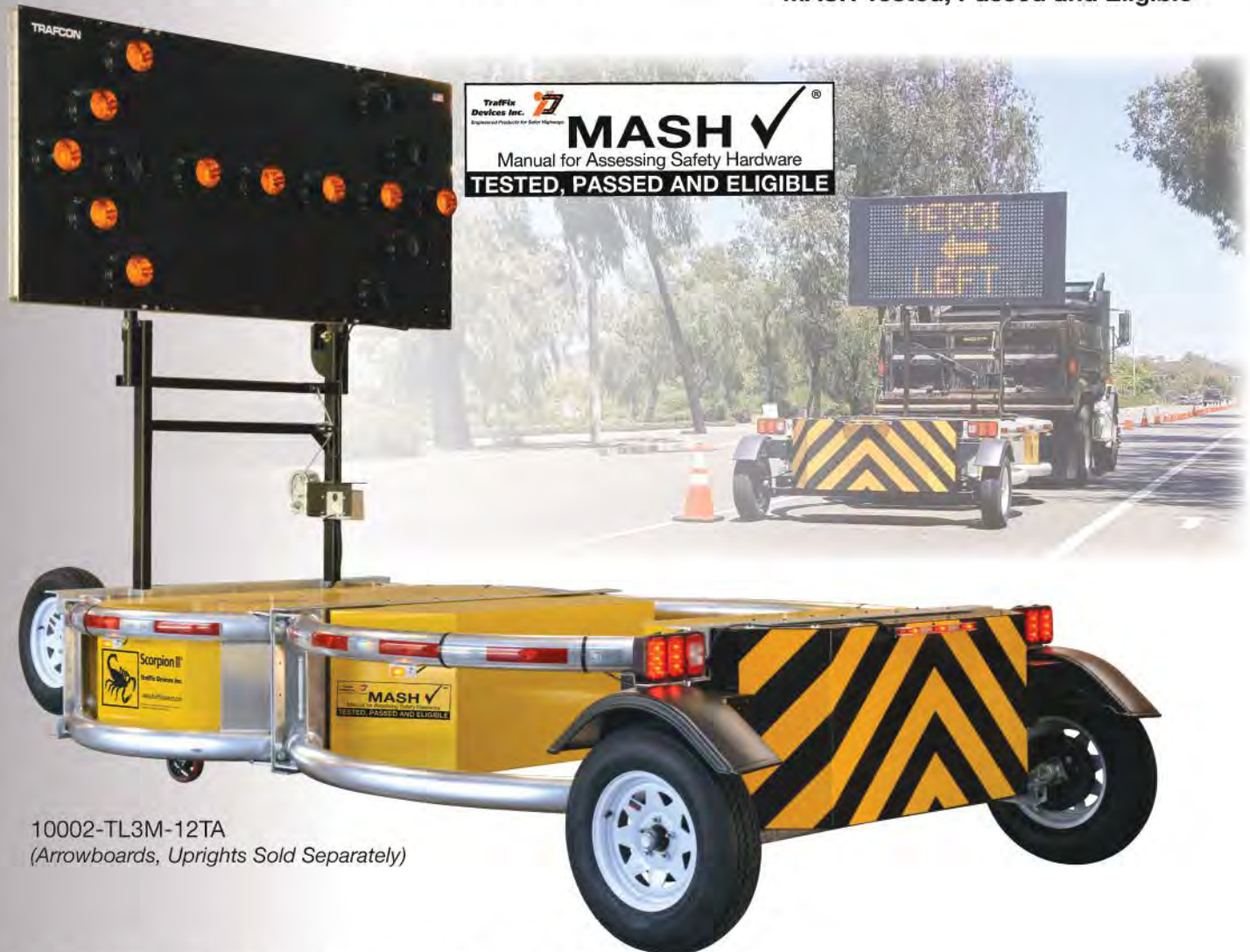
10002-TL3M-12TA (Arrowboards, Uprights Sold Separately)

Scorpion II ® TL-3 Towable Attenuator MASH Tested, Passed and Eligible