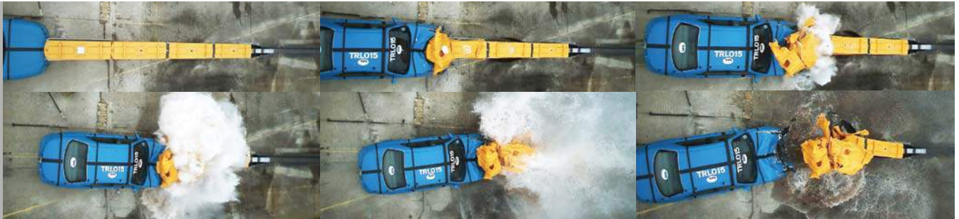
Tested and Passed: EN1317-4 P4 Impact Speed: 110 Km/h Vehicle Type: 1500 kg Bullet Vehicle Impact Angle: Head-On Centre