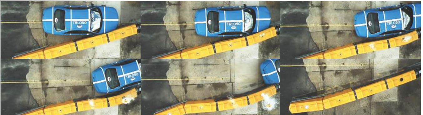
Tested and Passed: EN1317-4 P4 Impact Speed: 110 Km/h Vehicle Type: 1500 kg Bullet Vehicle Impact Angle: 15° Side