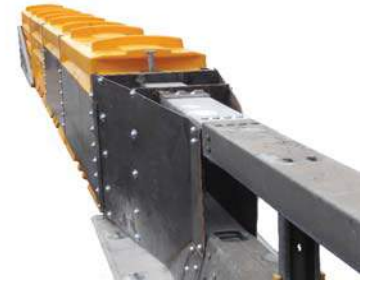
Saving Lives with the SLED EURO-TERMINAL