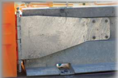
Steel Barrier Attachment