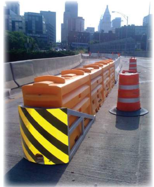
SLED™ TL-3 in Downtown Cincinnati, Ohio