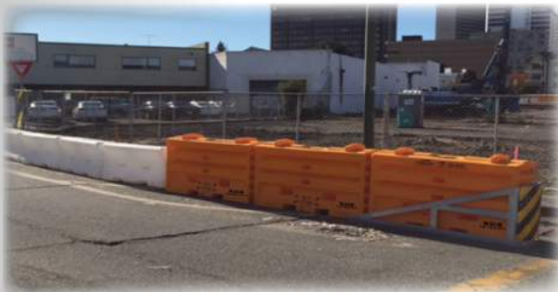
SLED™ TL-2 in use on an Oakland Roadway