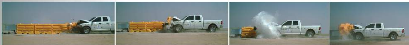
SLED™ TL-3 4900 lb. Pick-Up Truck Impact Attached to Concrete Median Barrier Wall

Each SLED module is manufactured from a high visibility yellow polyethylene that is UV stabilized to minimize degradation. It is designed to deform and rupture on impact, absorbing the energy of the errant vehicle. SLED has the most versatile transition for shielding all permanent and temporary portable barriers. The combination of hinging and contouring allows the transition panels of the SLED End Treatment to be attached to narrow, wide or other profile shapes with either converging, or diverging angles, up to 10 degrees.