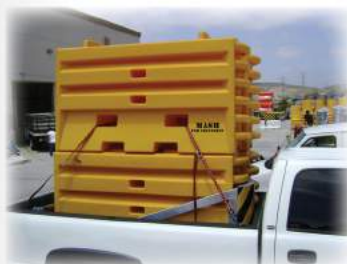
SLED™ TL-3 Transports in a Pick-Up Truck