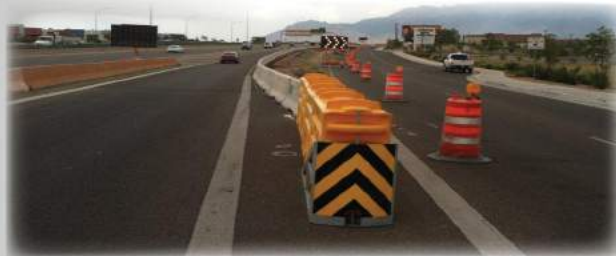
SLED™ TL-3 in New Mexico