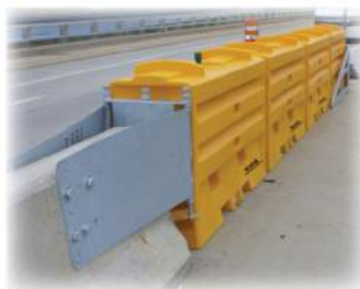
Concrete Barrier Attachment