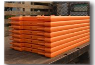
Four Molded-In Stacking Lugs for Secure Transport and Storage.