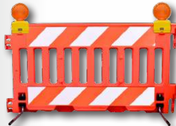
Locations for Two Barricade Lights and Recessed Areas for Reflective Sheeting