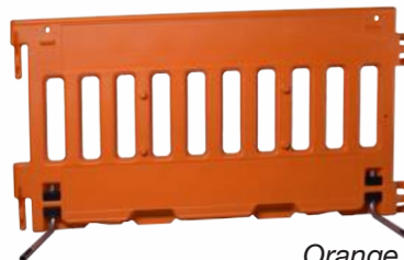
57000-AO Orange ADA Pedestrian Wall