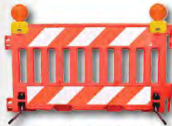
Locations for Two Barricade Lights and Recessed Areas for Reflective Sheeting