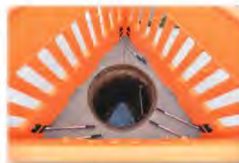
Protect Pedestrians From Work Zone Hazards