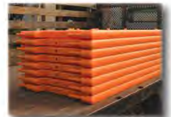
Four Molded-In Stacking Lugs for Secure Transport and Storage.