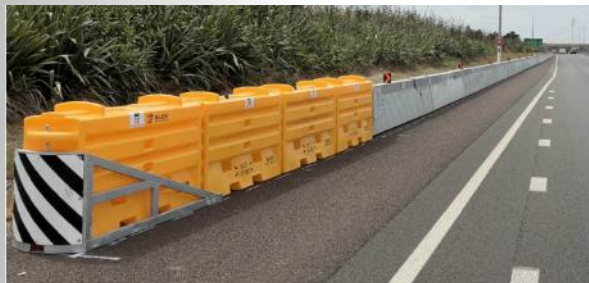
HV2 Barrier can be used with a variety of end treatments