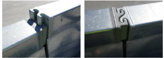
Strong "S" connectors keep barrier sections securely linked