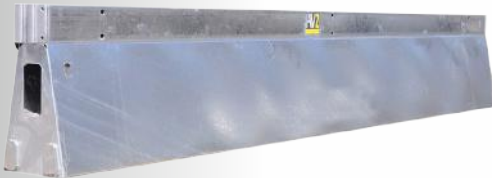
Durability of steel - freestanding - no anchors required

The HV2 Barrier is the ultimate freestanding, temporary longitudinal barrier system, bringing improved productivity and safety to worksites. The barrier's patented hybrid technology and unique connectors offer high containment and low deflection, while remaining economical to transport and deploy with no time-consuming anchoring required.