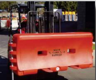
Water-Cable Barrier can be easily lifted and placed using a forklift or pallet jack