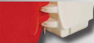
Water-Cable Barrier can pivot 30-degrees and be locked together with steel connection pins