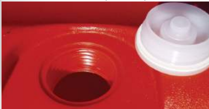
Tamper resistant, offset drain plug with coarse buttress thread