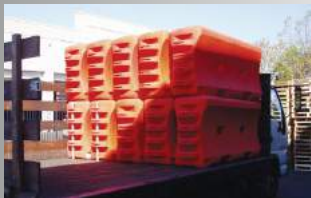
Water-Cable Barrier stacks for storage and transportation

Water-Cable Barrier to be 72" (1.9 m) long x 18" (0.46 m) wide x 32" (0.8 m) tall and molded from polyethylene. Water-Cable Barrier to be MASH tested, passed and eligible for TL-1 31 mph (50 km/hr) and TL-2 43.5 mph (70 km/hr) barrier applications. Individual wall shall weigh 100 lbs (45.4 kg) including internal cables empty and 1,070 lbs. (485.3 kg) when filled. Three 3/8" diameter stranded steel cables are molded into the wall to contain the impacting vehicle during an accident. Standard colors are orange/red and white, product may also be produced in other colors. Water-Cable Barrier modules are connected together with galvanized steel T-pins passing through a double wall knuckle which minimizes breakage at hinge points. Water-Cable Barrier shall pivot up to 30 degrees when connected. Water-Cable Barrier to have one 8 in (203 mm) diameter fill hole for quick filling and a twist lock cap for closure. Water-Cable Barrier will have molded fork lift slots to provide easy movement. Drain plug to be centered on the modules to protect against cracking or breaking and have coarse buttress threads for quick removal and insertion. Water-Cable Barriers shall stack for easy movement and storage.