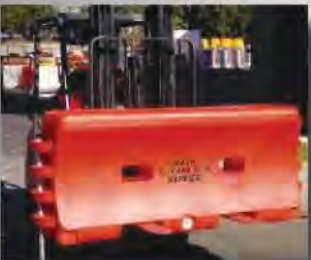
Water-Cable Barrier can be easily lifted and placed using a forklift or pallet jack