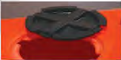
Large 8" fill hole speeds filling process, includes twist-lock plastic cap