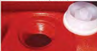
Tamper resistant, offset drain plug with coarse buttress thread