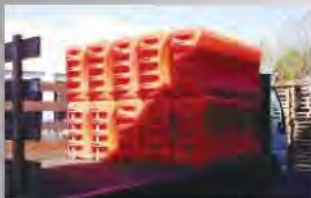
Water-Cable Barrier stacks for storage and transportation

Water-Cable Barrier to be 72" (1.9 m) long x 18" (0.46 m) wide x 32" (0.8 m) tall and molded from polyethylene. Water-Cable Barrier to be MASH tested, passed and eligible for TL-1 31 mph (50 km/hr) and TL-2 43.5 mph (70 km/hr) barrier applications. Individual wall shall weigh 100 lbs (45.4 kg) including internal cables empty and 1,070 lbs. (485.3 kg) when filled. Three 3/8" diameter stranded steel cables are molded into the wall to contain the impacting vehicle during an accident. Standard colors are orange/red and white, product may also be produced in other colors. Water-Cable Barrier modules are connected together with galvanized steel T-pins passing through a double wall knuckle which minimizes breakage at hinge points. Water-Cable Barrier shall pivot up to 30 degrees when connected. Water-Cable Barrier to have one 8 in (203 mm) diameter fill hole for quick filling and a twist lock cap for closure. Water-Cable Barrier will have molded fork lift slots to provide easy movement. Drain plug to be centered on the modules to protect against cracking or breaking and have coarse buttress threads for quick removal and insertion. Water-Cable Barriers shall stack for easy movement and storage.