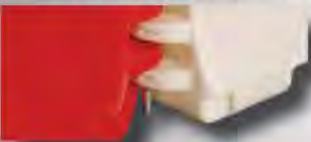
Water-Cable Barrier can pivot 30-degrees and be locked together with steel connection pins