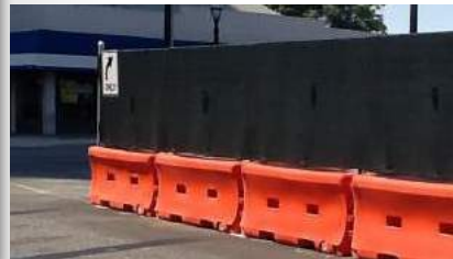
Fence can be Screened for Greater Security