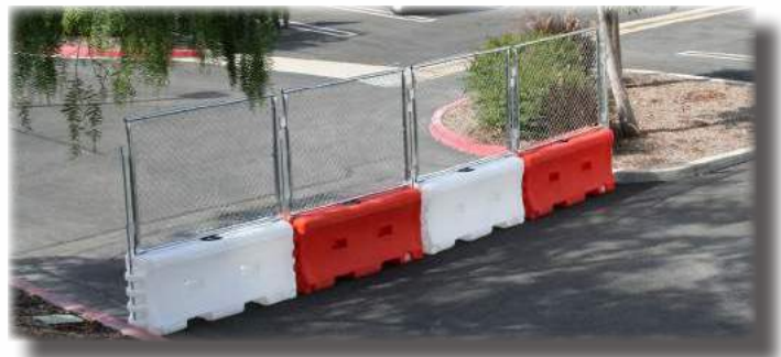
Ideal for vertical construction. Secure and easy to deploy.