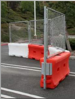
Water-Wall Fence Rotates up to 30° Degrees

The chain link fence will attach to the top of a longitudinal barrier, (TrafFix Water-Wall™), creating additional security to a work zone. The mesh fence will be made of 11 gauge steel, connected to vertical steel posts of 1 5/8" diameter. Fence sections will be 6' wide x 4' tall. Each fence section shall weigh no more than 42 lbs including the connector T-pin. Each T-pin will extend down through the sections of fence into the knuckles of the TrafFix Water-Wall to securely connect the fence to the wall. Each T-pin shall have a hole at the upper end for a security bolt to enhance security. The fence will accommodate a 6' single gate or a 12' double gate for entrance or exit from the work zone. For maximum stability, the TrafFix Water-Wall, filled with water will weigh 1,110 pounds. Overall height of the Water-Wall Fence attached to the top of the TrafFix Water-Wall will be a minimum 84".