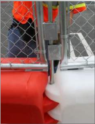
T-Pin Connects Wall to Wall and Fence to Fence