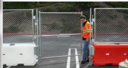
Secure entry with a 6' Single Gate