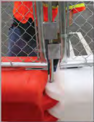
T-Pin Connects Wall to Wall and Fence to Fence