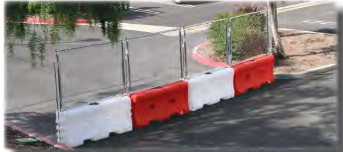
Ideal for vertical construction. Secure and easy to deploy.