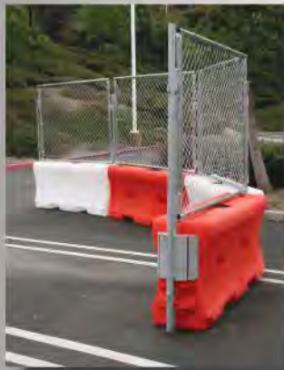
Water-Wall Fence Rotates up to 30° Degrees

The chain link fence will attach to the top of a longitudinal barrier, (TrafFix Water-Wall™), creating additional security to a work zone. The mesh fence will be made of 11 gauge steel, connected to vertical steel posts of 1 5/8" diameter. Fence sections will be 6' wide x 4' tall. Each fence section shall weigh no more than 42 lbs including the connector T-pin. Each T-pin will extend down through the sections of fence into the knuckles of the TrafFix Water-Wall to securely connect the fence to the wall. Each T-pin shall have a hole at the upper end for a security bolt to enhance security. The fence will accommodate a 6' single gate or a 12' double gate for entrance or exit from the work zone. For maximum stability, the TrafFix Water-Wall, filled with water will weigh 1,110 pounds. Overall height of the Water-Wall Fence attached to the top of the TrafFix Water-Wall will be a minimum 84".