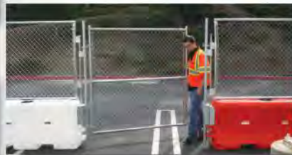
Secure entry with a 6' Single Gate