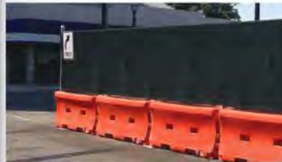
Fence can be Screened for Greater Security