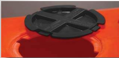
Large 8" fill hole speeds filling process, includes twist-lock plastic cap