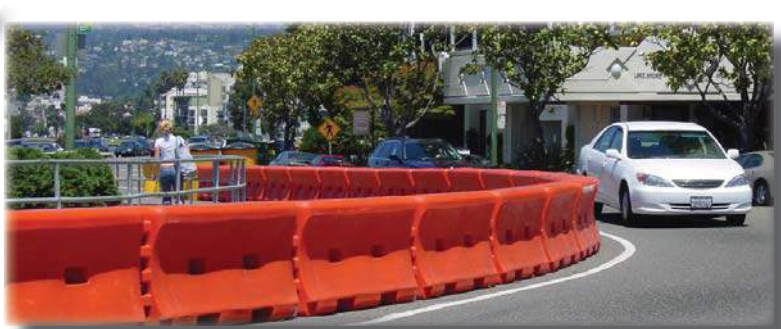
30-degree pivoting hinge design allows the TraFFix Water-Wall to handle curved roads