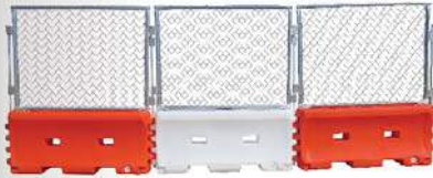
Water-Wall Fence can be easily attached to Water-Wall for additional job-site security.