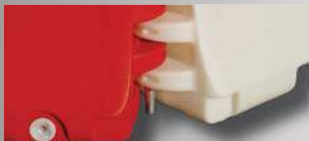
Water-Wall can pivot 30-degrees and be locked together with steel connection pins