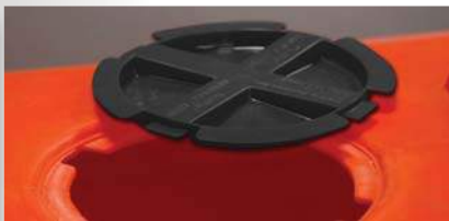
Large 8" fill hole speeds filling process, includes twist-lock plastic cap