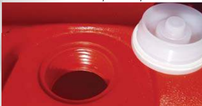
New tamper resistant, offset drain plug with coarse buttress thread