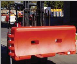
Water-Wall can be easily lifted and placed using a forklift or pallet jack