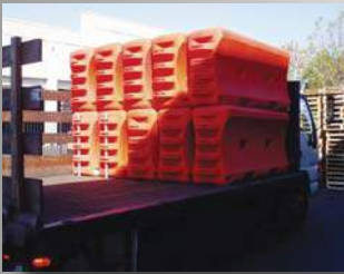
Water-Wall stacks for storage and transportation

Water-Wall barrier to be 72" long x 32" tall x 18" wide and molded from linear low density polyethylene. Water-Wall to be NCHRP-350 TL-1 tested and passed as a barrier. Individual wall shall weigh 80 lbs. empty and 1,110 lbs. filled. Standard colors are white or orange. Water-Wall sections are connected together with galvanized steel T-pins passing through a double wall knuckle which minimizes breakage at hinge points. Wall shall pivot up to 30 degrees when connected. Water-Wall to have one 8" diameter fill hole for quick fill and a twist lock cap for closure. Water-Wall will have molded thru holes to provide easy movement. Drain plug to be offset to protect against cracking or breaking and have coarse buttress threads for quick removal and attachment. Water-Walls shall stack for easy movement and storage.