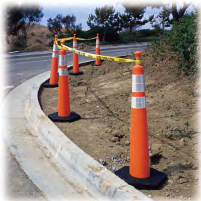
42" Grabber-Cone with caution tape wrapped around handle