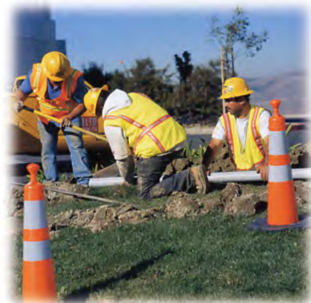
28" Grabber-Cones and Traffic vests provide high visibility to help protect workers