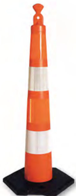
42" Grabber-Cone with (2) 6" orange and (2) 6" white bands of 3M™ diamond grade reflective sheeting