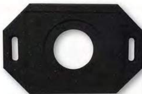
30 lb. base

The composite construction offers strength and durability. Both bases are made from 100% recycled rubber. (Weight 10, 16 or 30 lbs.)