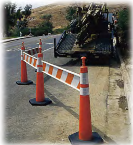
Channelize traffic with 42" Grabber-Cone and optional plastic barricade panels