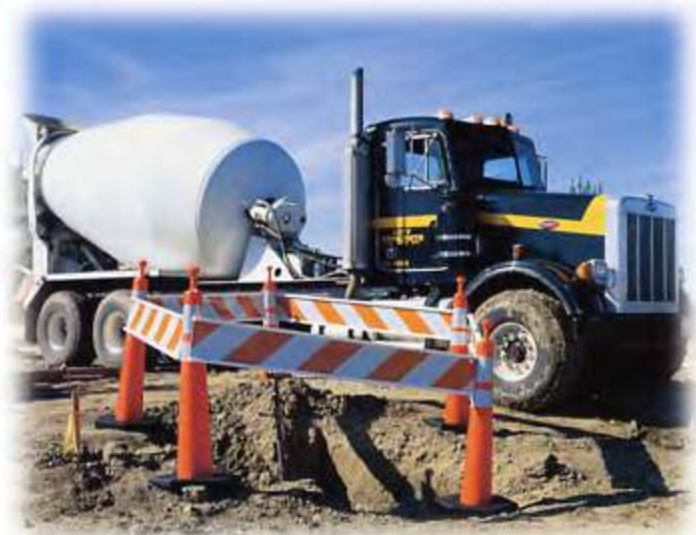
42" Grabber-Cone and plastic rails can totally enclose bores and construction work areas