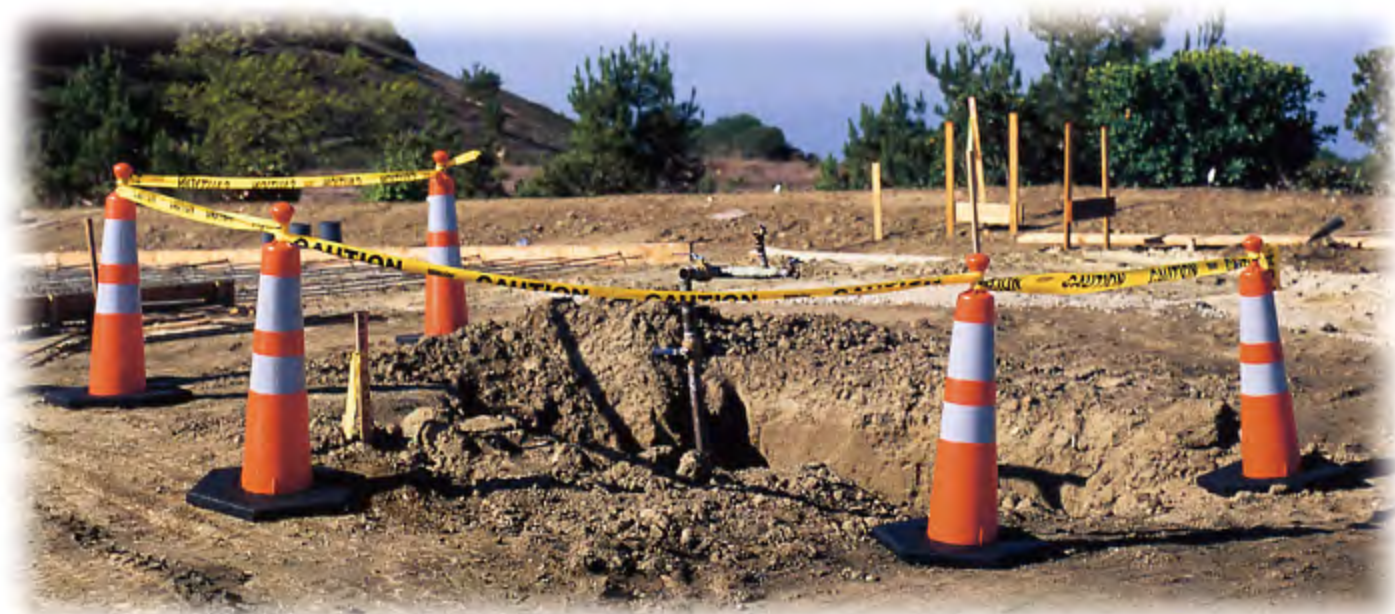
28" Grabber-Cones with caution tape provide an ideal way to protect hazardous off-road areas