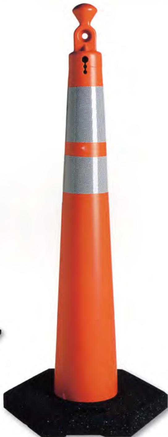
42" Grabber-Cone with (1) 6" and (1) 4" band of white reflective sheeting and recycled rubber base