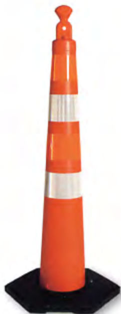
42" Grabber-Cone with (2) 4" orange and (2) 4" white bands of 3M™ diamond grade reflective sheeting