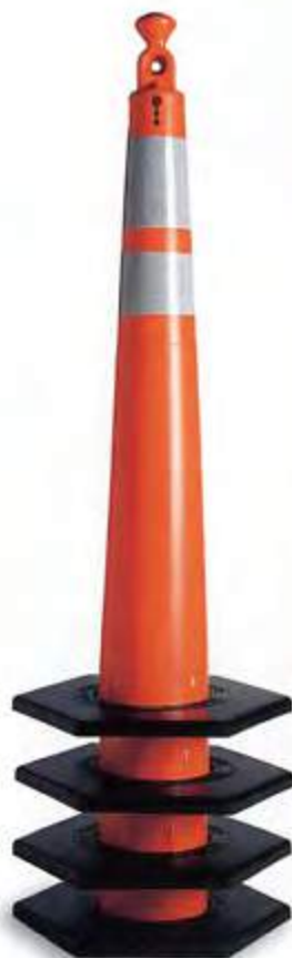
Cones stacked with rubber bases