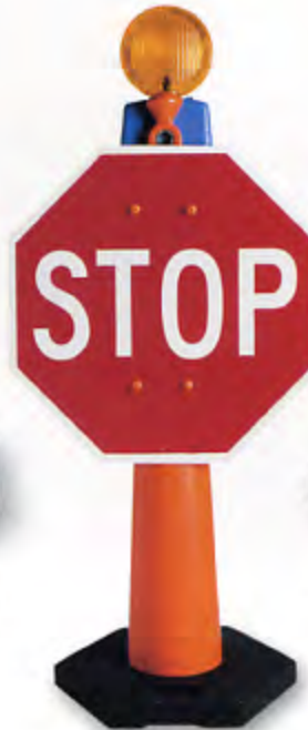
42" Grabber-Cone with stop sign and warning light