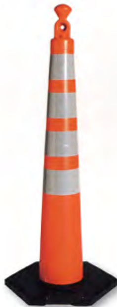
42" Grabber-Cone with (4) 4" bands of white reflective sheeting