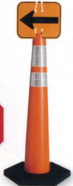
42" Grabber-Cone with directional arrow sign