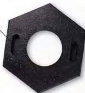
10 or 16 lb. base