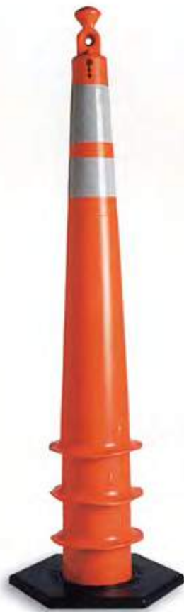
Alternate stacking method