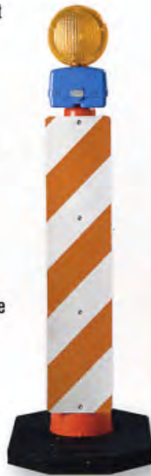
8'x36" Grabber Vertical Panel Barricade with light and 30 lb. recycled rubber base