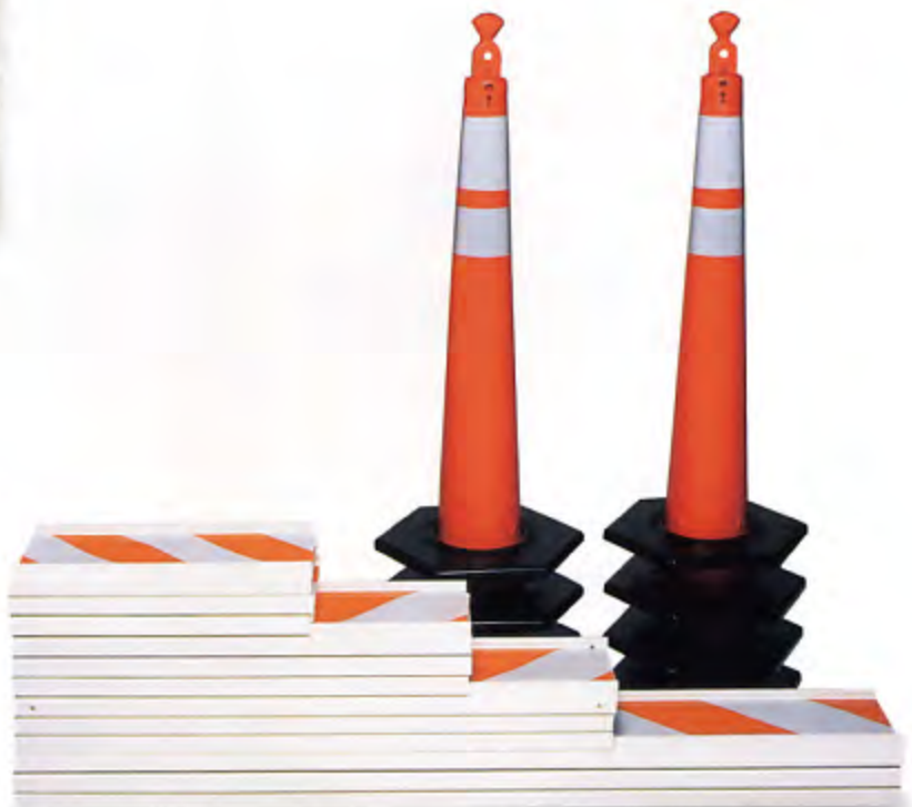
The Grabber truck kit is a handy assortment of linkable plastic barricade panels and 42" Grabber-Cones. Toggled panels come in 2, 3, 4 and 6 foot lengths