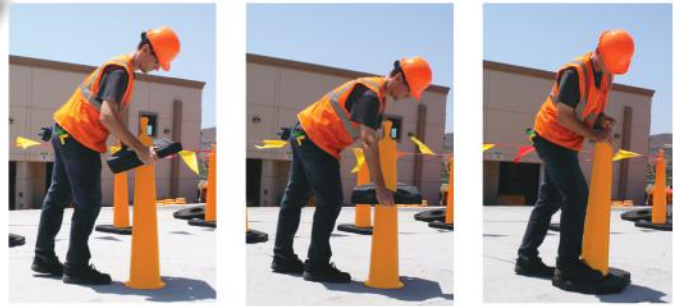
Drop over base for easy set-up