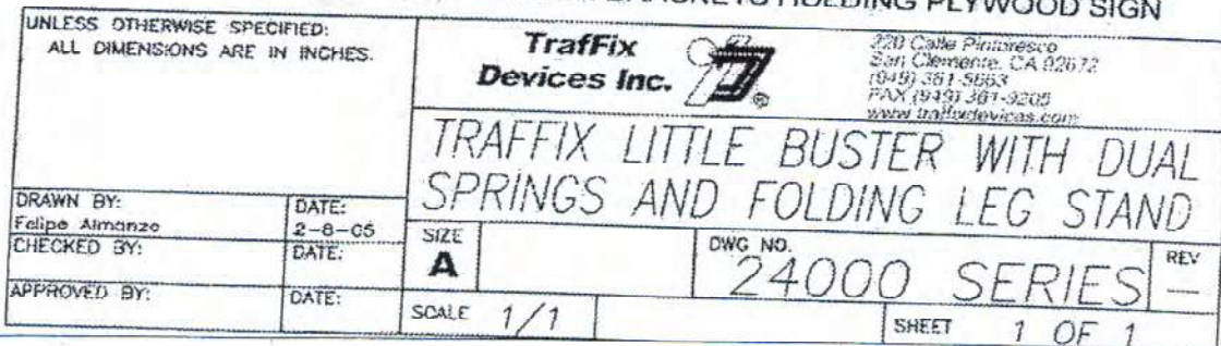
FIGURE 1: MANUFACTURER'S DRAWING OF TEST ARTICLE